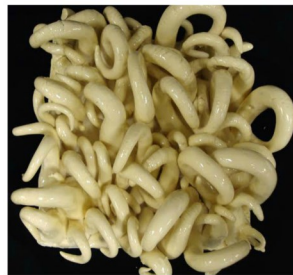
Silver Key Winners 2017

If you have any questions or concerns please free to contact please feel free to contact Nurse Rogers at 513-824-7500 or email to jjrogers@trlsd.org