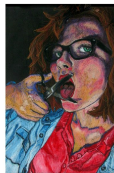
Gold Key Winners 2017